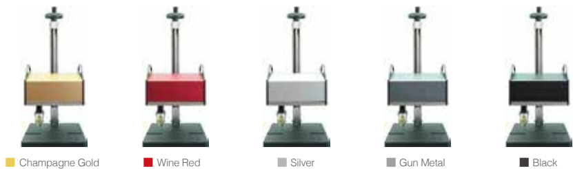
■ Champagne Gold