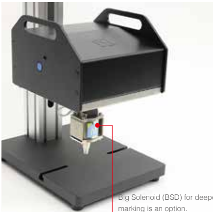
Big Solenoid (BSD) for deeper marking is an option.