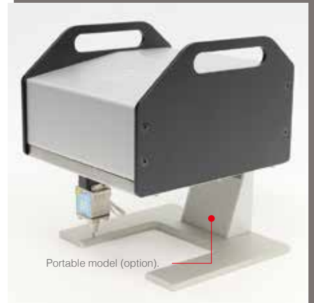
Portable model (option).