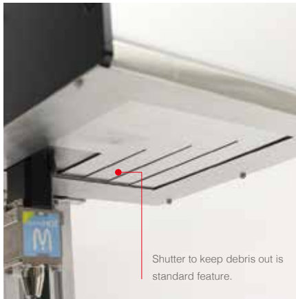
Shutter to keep debris out is standard feature.